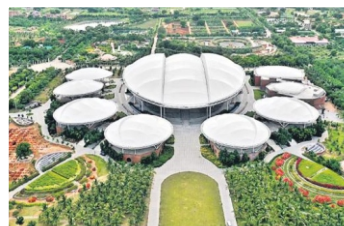
Kanha Meditation Center