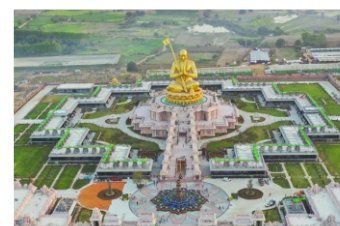
Statue of Equality